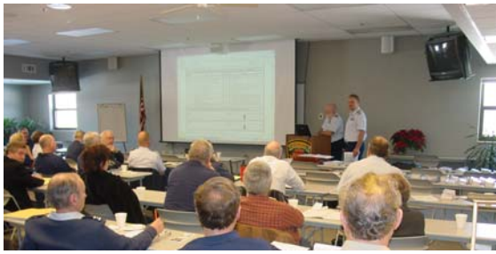
Operations Workshop held March 10.